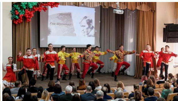
Shukshin Altai State Humanities Pedagogical University