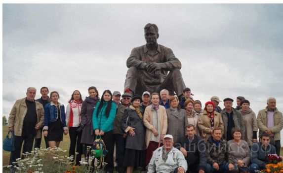
Shukshin monument in Srostki